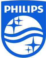
EcoHL Twist 45W CDL E27 220-240V 50/60Hz